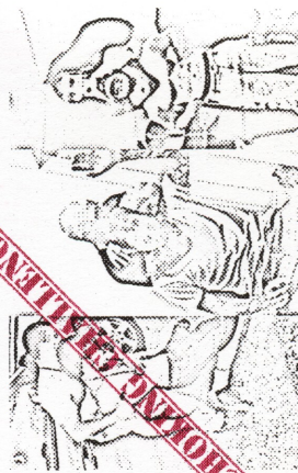
GHOST PEPPER CHALLENGE

The game starts out as between the administrator and the participant, with each of the administrator will see up a difficult task for the participant to do. The difficulty starts off fairly easy—listening to certain genres of music to watching horror-style movies. As the days go on, the tasks grow increasingly difficult such as staying up until all hours of the night to mutilating the skin along with carving a "whale" symbol onto their arm. The final task and end to the game is the person committing suicide.