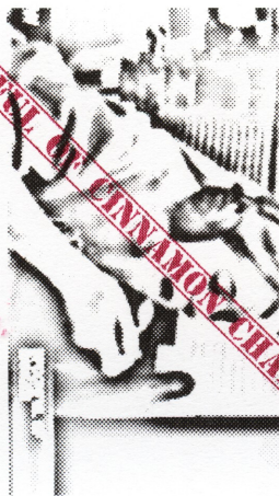
SPONSOR OF CINNAMON CHALLENGE

Fire challenge is an activity which refers to the application of flammable liquids to one's body and then setting the liquids aflame, while being video recorded.