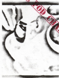
TIDE POD CHALLENGE

Consumer Reports reported that between the Tide pods' introduction in 2012 through early 2017, eight deaths had been reported due to the ingestion of laundry detergent pods, with six of the eight deaths resulting from a pod manufactured by P&G.